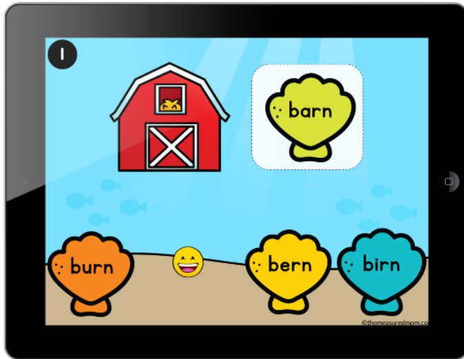
Google Slides presentation

This product from The Measured Mom® comes in two different versions: