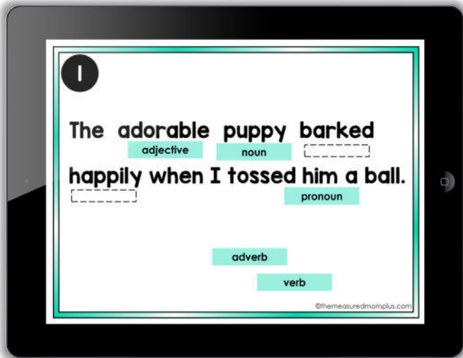
Google Slides or Seesaw activity (10 slides)

When you purchase, you have the option of using the Google Slides activity, the Seesaw activity, Google Forms (in a quiz format), or the printable activity sheets. The file includes specific instructions for using the digital versions. The same questions are in all four versions.